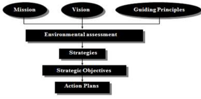
Figure 1: The strategic planning process